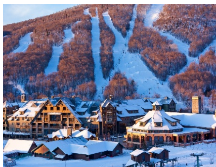
Stowe Mountain Resort