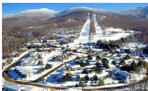
Smuggler's Notch Resort

(Viri slik: https://www.goodreads.com/book/show/2180821.Ski_North_America https://www.firsttracksonline.com/2012/09/07/sugarbush-to-break-ground-on-new-slopeside-homes https://www.snowmagazine.com/ski-resort-guide/usa/smuggler-s-notch-ski-resort https://www.onthesnow.com/vermont/stowe-mountain-resort/ski-resort . Pridobljeno: 20. 4. 2021.)