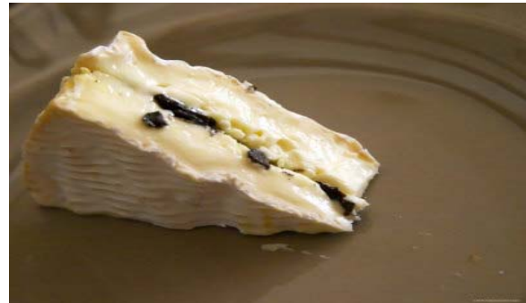
Cheese stuffed with truffles.

meet demand," Babé Peybere told us as we roamed the family's sublimely fragrant factory, where workers brush, sort, jar and ship some of the crop.