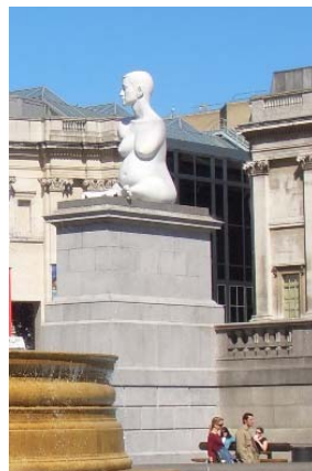
A plinth on Trafalgar Square