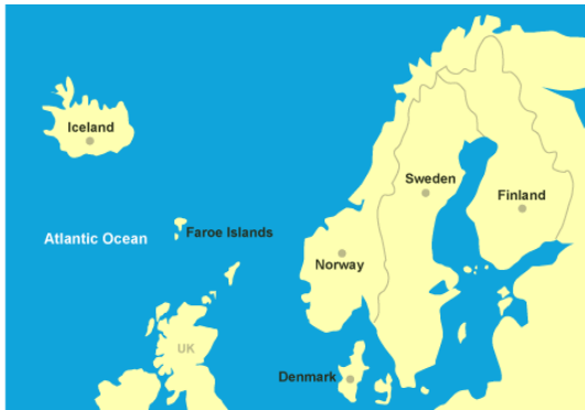
Image from: < http://www.uknetguide.co.uk/Holiday-Guides/Scandinavia/ >, January 5, 2010

Engulfed in snow flakes and icy landscapes, experience the elegance of Scandinavian palaces, ___0___ and the magic of the midnight sun. Explore the buzzing capital of Helsinki, dive into ___23___ and wander through the feral forests.